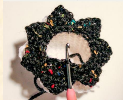
Rounds 14-15: working in the unworked inner loops of the black skirt.

*Note: white was used instead of yellow here.