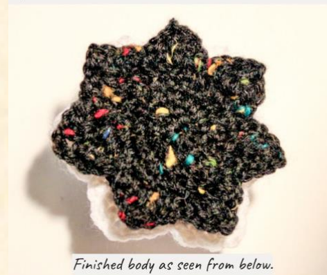
Finished body as seen from below.